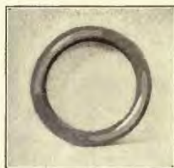
FIG. 38. WELDED RING.

5. Shape the ring over the horn of the anvil, or a mandrel if you have one. The completed ring is shown in Fig. 38.