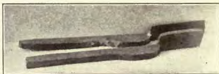
FIG. 57. TWO JAWS OF HOOF PARERS.

The hoof parers, or hoof paring tongs as it is sometimes called, is a tool any farmer will be glad to own. It is made much like the straight lip tongs, Plate 29. The end of one jaw is sharp and the other is blunt.