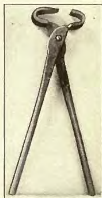
FIG. 58. HOOF PARERS.

5. Drill the hole in one jaw; place the two jaws together and mark the location of the hole in the second; drill the second, and rivet together.