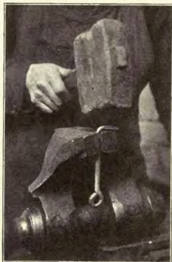
FIG. 17. BENDING HOOK IN THE VISE.

5. Bend the hook, first bending as in Fig. 17. Then bend over the horn of the anvil as for the eye. Bend the point out slightly as in Fig. 16, and blacken. The gate hook completed should look like the drawing, Plate 3, and Fig. 18.