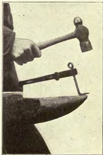
FIG. 18. BENDING THE POINT.

Notes. —By this time you should have formed the habit of always squaring the ends of a piece of stock. This step will not be mentioned in the directions for making future articles, in this book.